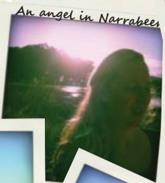
An angel in Narrabeen