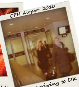
CPH Airport 2010