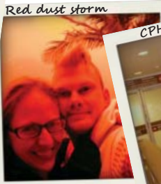
Red dust storm