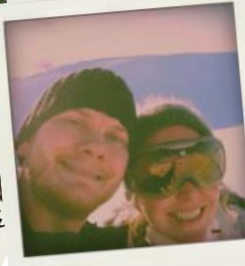
Skiing in Norway