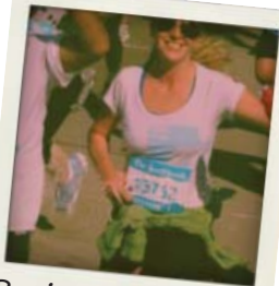
Racing for the gold

If you feel you would like other arrangements, please contact us.