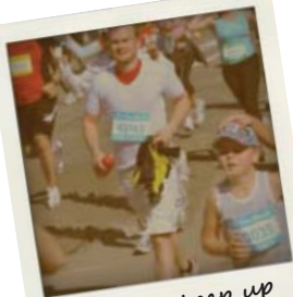
Trying to keep up