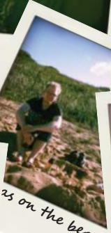
as on the beach