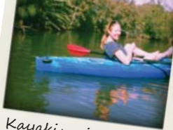
Kayaking in Narrabeen