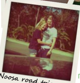
Noosa road trip