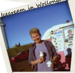
Icecream in Wollongong