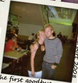
The first goodbye