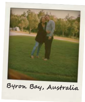
Byron Bay, Australia